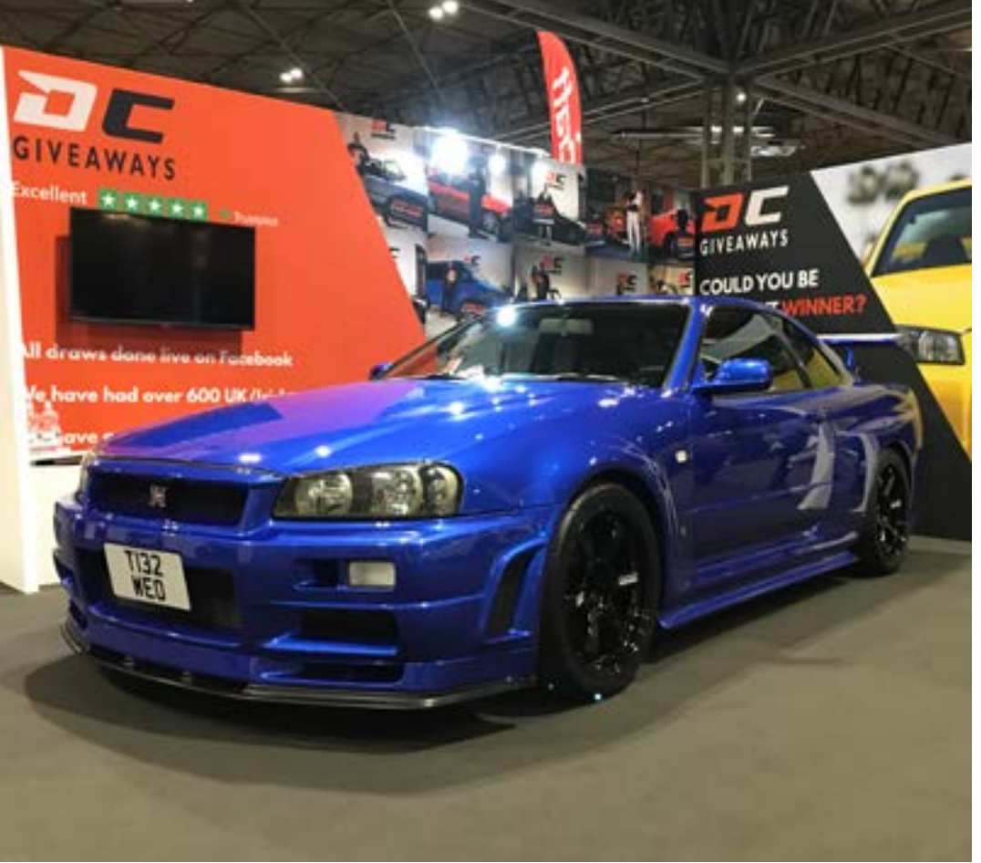
NISSAN SKYLINE GT-R R34