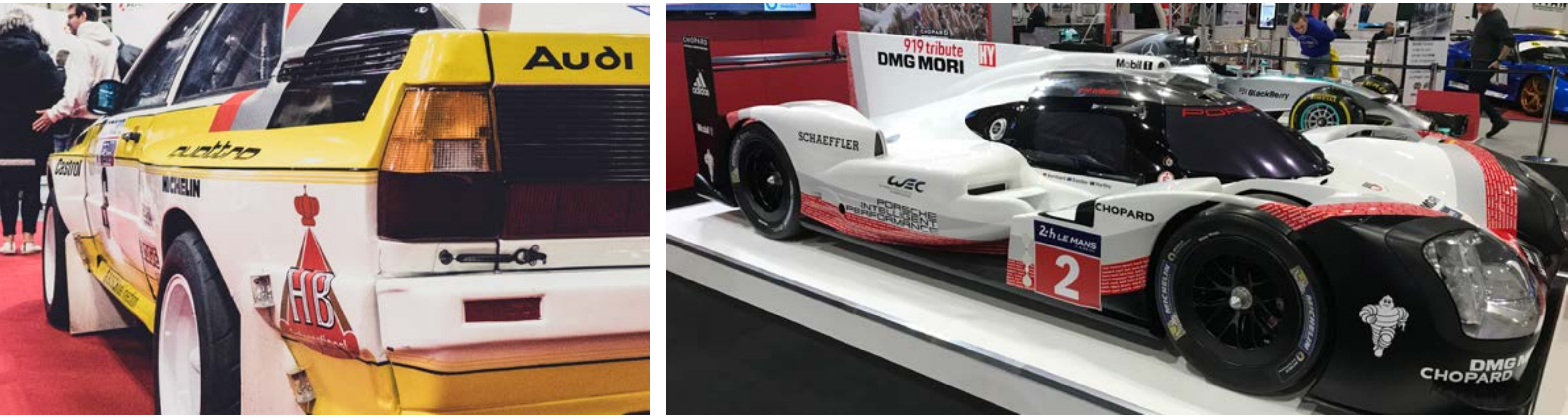
AUDI SPORT QUATTRO S1

It is a show where past meets present. From heritage vehicles to modern day race cars. From factory made pieces of art to refurbished and tuned past and modern classics.